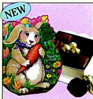
Bunny & Carrot Box 4 oz. $6.80 (#179)