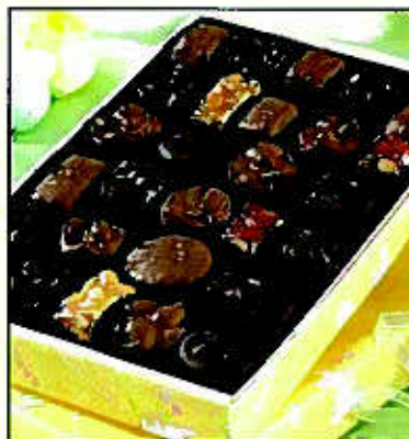
Nuts & Chews 1 lb. $16.90 (#334)