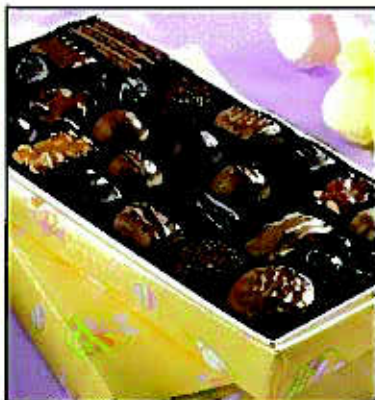
Assorted Chocolates 1 lb. $16.90 (#318)