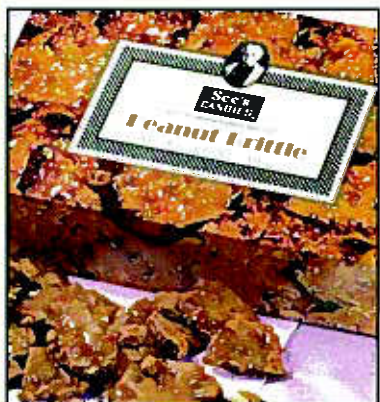
Peanut Brittle 1 lb. 8 oz. $16.50 (#355) MSR