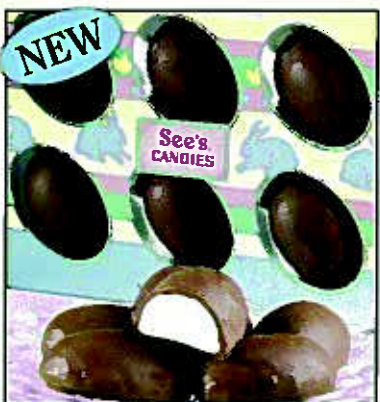
Marshmallow Eggs 4.8 oz. $6.80 (#731)