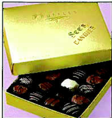
Truffles 1 lb. $19.40 (#902)