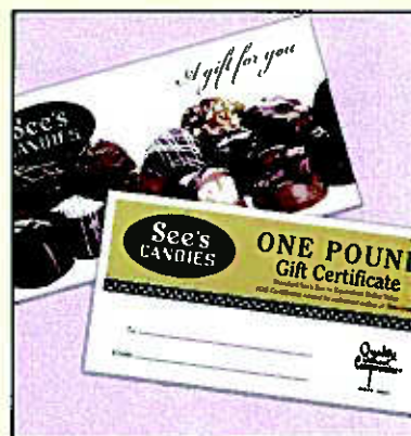
Gift Certificate Continental: 1 lb. $16.90 (#767)