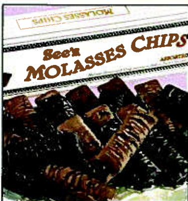
Assorted Molasses Chips 8 oz. $8.45 (#360)