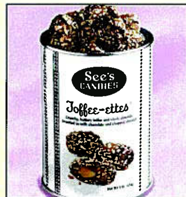
Toffee-ettes® 1 lb. $16.90 (#316) MSR