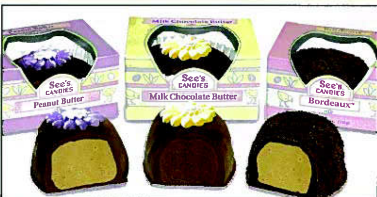
Peanut Butter, Milk Chocolate Butter or Bordeaux™ Egg Peanut Butter (#939) • Milk Chocolate Butter (#734) • Bordeaux™ (#486) 4 oz. $6.80