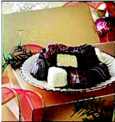
Truffles 1 lb. $18.90 (#902)