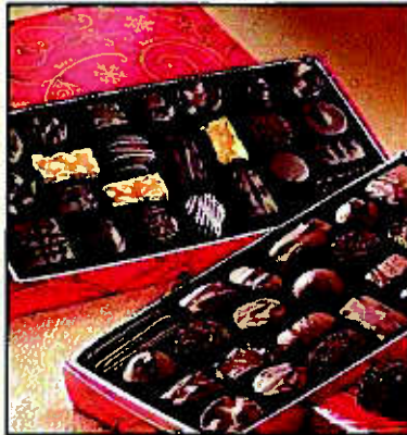
Milk or Dark Chocolates Milk (#326) • Dark (#330) 1 lb. $16.50