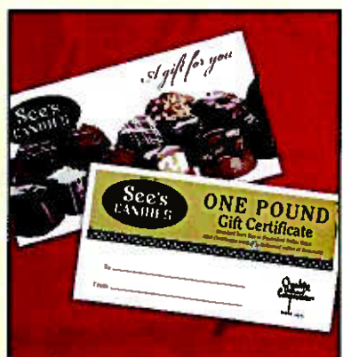
Gift Certificate Continental: 1 lb. $16.50 (#767)