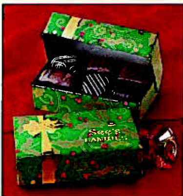
Mini Holiday Fancy Box 4 oz. $6.50 (#596)