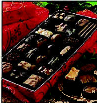
Assorted Chocolates 1 lb. $16.50 (#318)