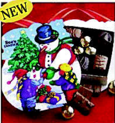
Jolly Snowman Box 4 oz. $6.50 (#9127)