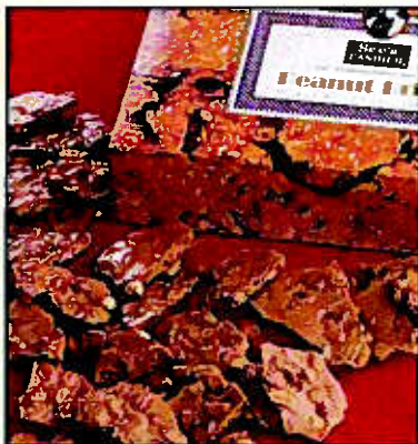
Peanut Brittle 1 lb. 8 oz. $15.90 (#355)