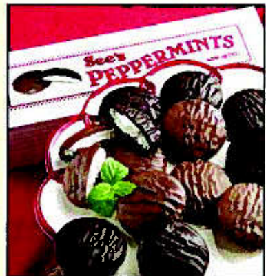
Assorted Peppermints 8 oz. $8.25 (#358)