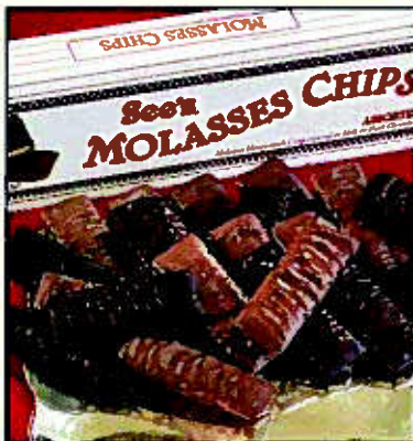
Assorted Molasses Chips 8 oz. $8.25 (#360)