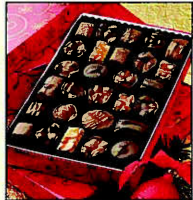
Nuts & Chews 1 lb. $16.50 (#334)